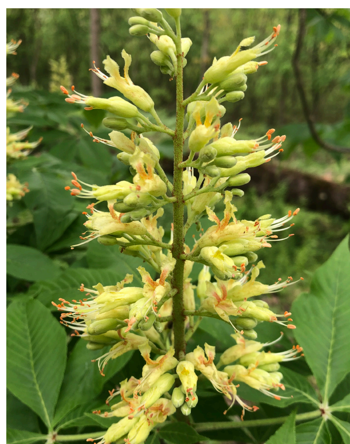
Aesculus glabra Ohio Buckeye Ohio's State Tree

In specific geographic areas, native plants thrive when growing in local soils with unique water, light, temperature, and growing conditions.