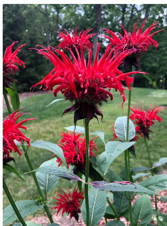
Monarda didyma Scarlet Beebalm