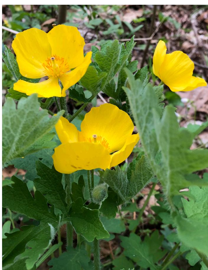
Stylophorum diphyllum Celandine Poppy