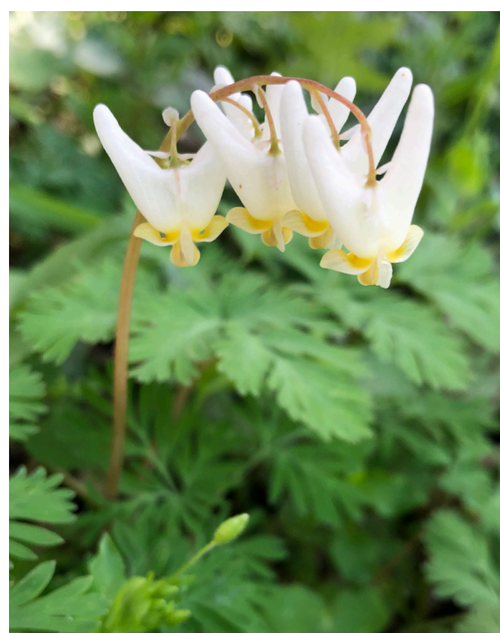
Dicentra cucullaria Dutchman's Breeches

A native plant is one that Has evolved over thousands of years In a specific geographic region Alongside local flora and fauna Without human intervention