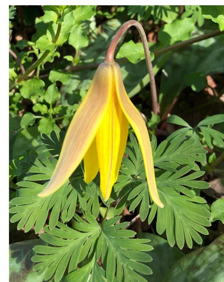
Erythronium americanum Yellow Trout Lily