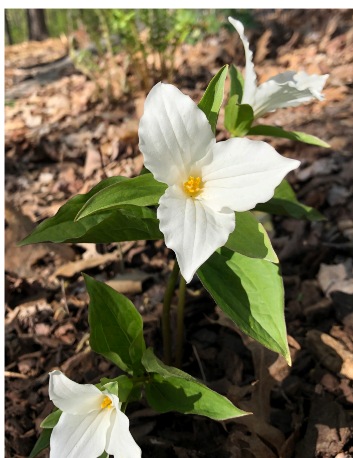
Trillium grandiflorum Great White Trillium Ohio's State Wildflower