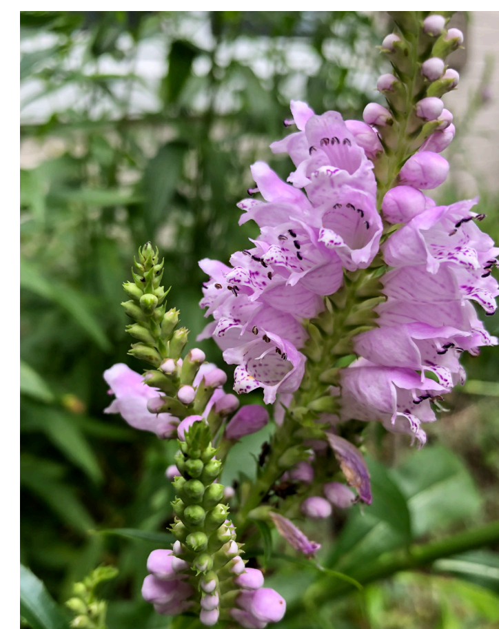
Physostegia virginiana Obedient Plant

Each native plant habitat, including prairies, woodlands, and wetlands, are filled with native plants perfectly adapted to growing in these diverse ecosystems.