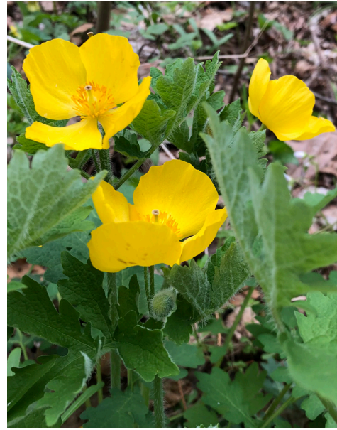
Stylophorum diphyllum Celandine Poppy