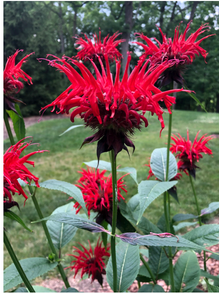
Monarda didyma Scarlet Beebalm