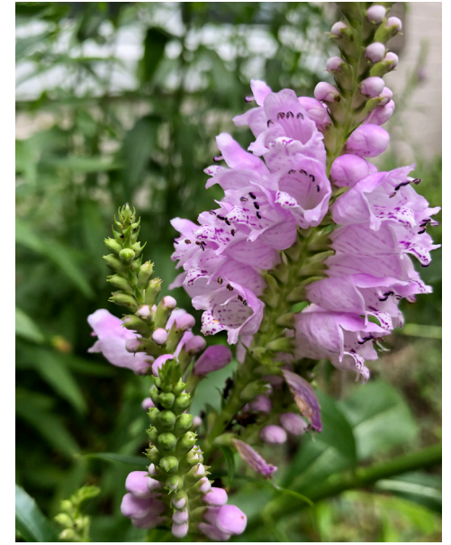
Physostegia virginiana Obedient Plant

Each native plant habitat, including prairies, woodlands, and wetlands, are filled with native plants perfectly adapted to growing in these diverse ecosystems.