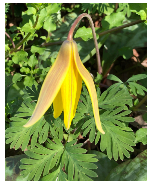
Erythronium americanum Yellow Trout Lily