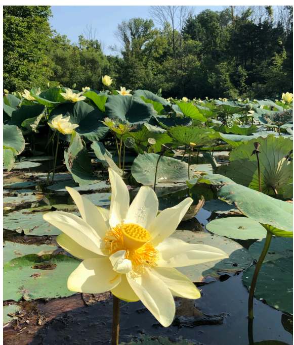
Nelumbo lutea American Lotus